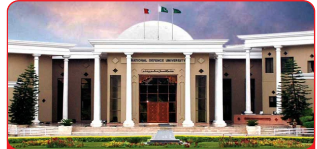
NDU ISLAMABAD (1320 KW)