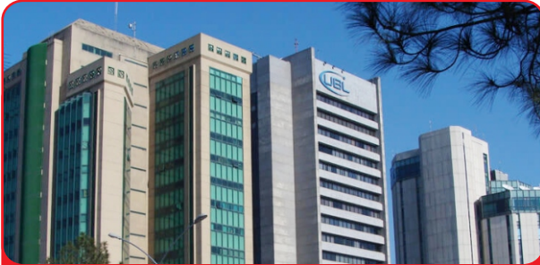
UBL TOWER ISLAMABAD (630 KW)