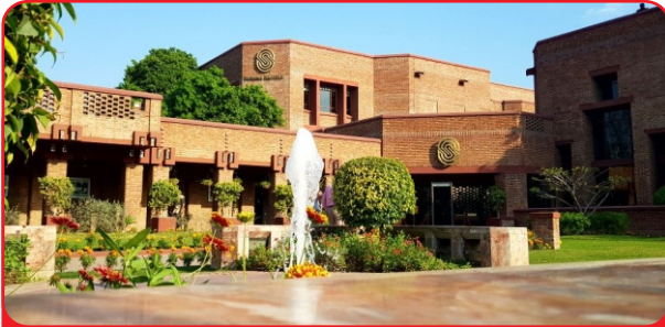
SERENA HOTELS FAISALABAD (Steam Boiler 2 TPH)