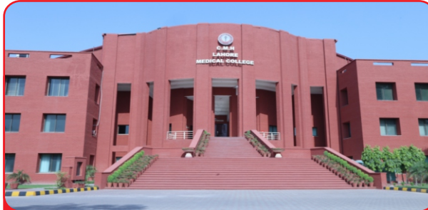
CMH LAHORE (Boilers 3150 KW)