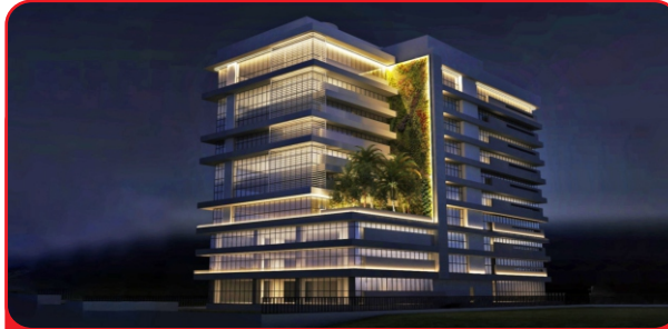
HIVE TOWER ISLAMABAD