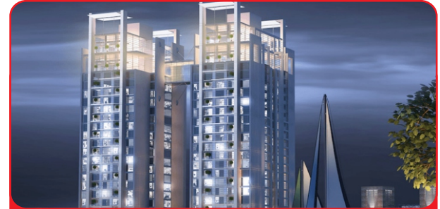
GRAND HYATT ISLAMABAD (2200 KW)