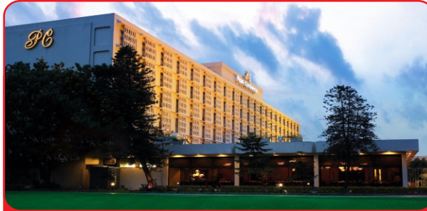
PEARL CONTINENTAL RAWALPINDI (Steam Boiler 2.5 TPH)