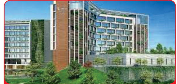
PKLI LAHORE (2780 KW)